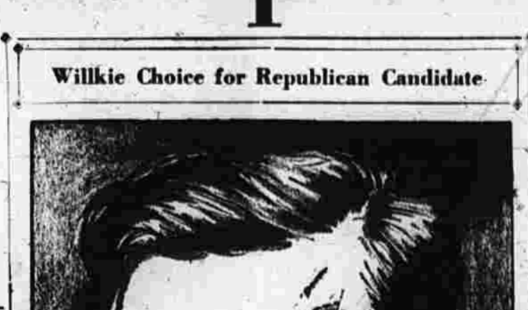
Wilkie Choice for Republican Candidate.

Nazis Will Not Agree To Peace Moves Now. Berlin's Reply to Feelers From London Unequivocal Statement Cautious Are Speaking.